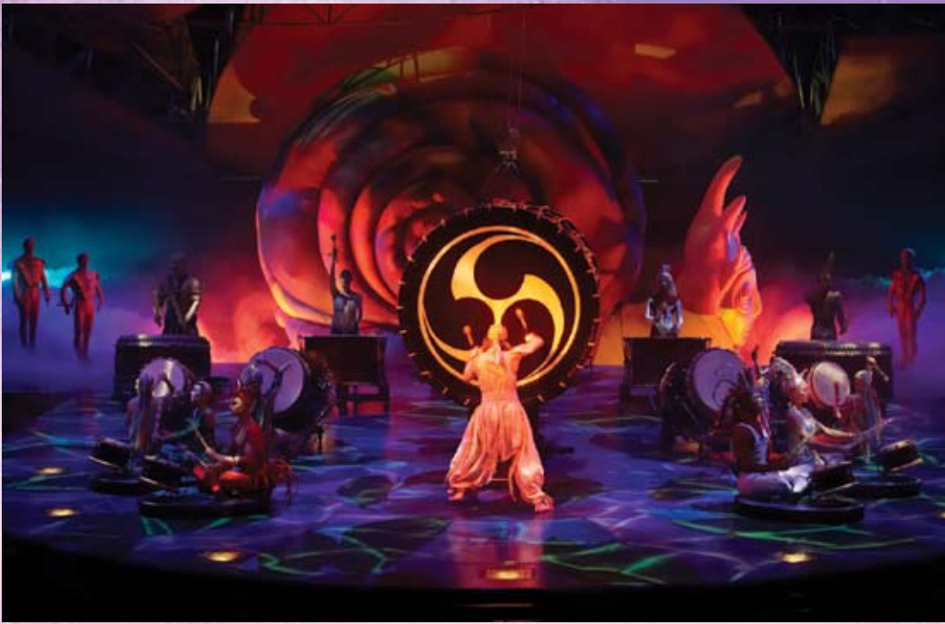
COSTUME: DOMINIQUE LEMIEUX.

Variations are created in the moment according to the artist's needs.